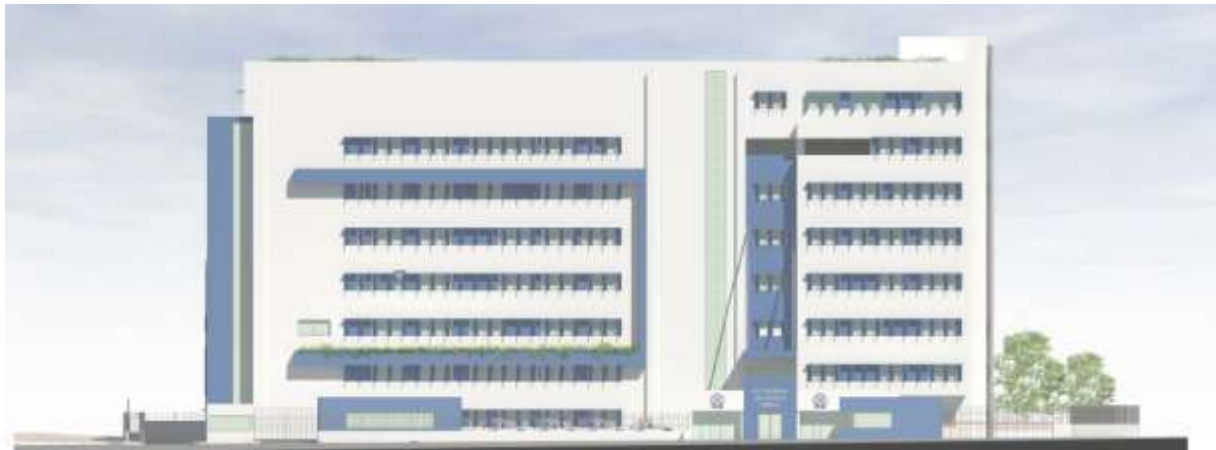
Main elevation of the building

It is an eight storey building in the shape of a "Π" separated by antiseismic joints into three independent sections. In the center of the "Π" a lower building is located. Access from all other wings to this central building is achieved through steel bridges. The plan area of each of the first floors is 2500m 2 , while the rest measure 1875m 2 per floor.