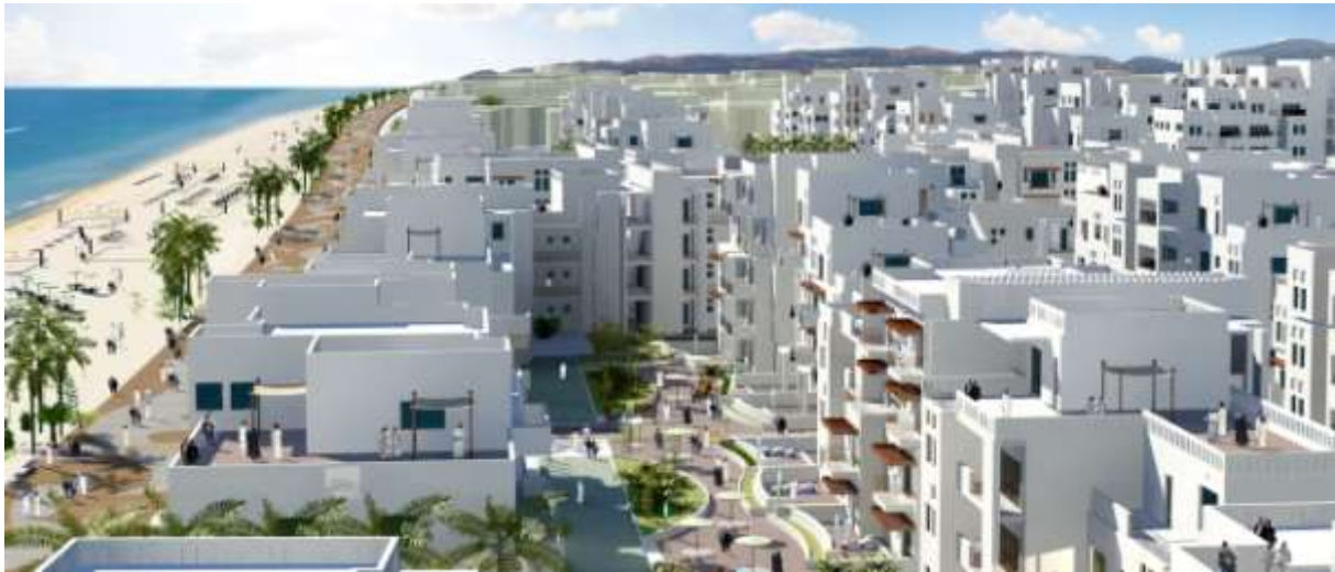
Complex of seaside apartment buildings (sections 1.1.2 - 1.4.2)

CONSTRUCTION: AECO Development LLC STRUCTURAL DESIGN: OMAN 2009 JV / KANON CONSULTING (2009 - 2010)