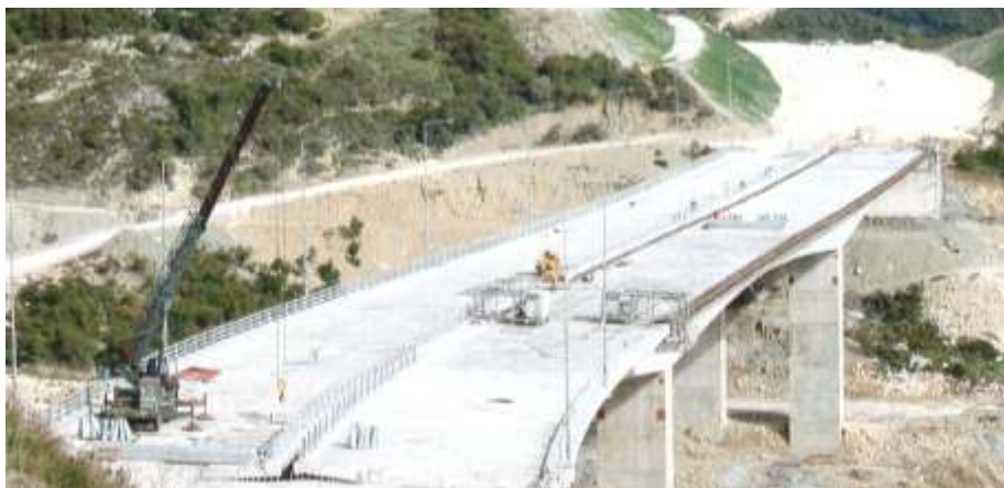
Bridge of Mesobounio: The construction of the superstructure has been completed