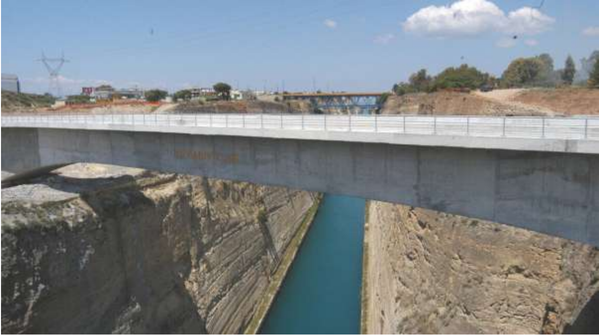
The construction of the Bridge over the Corinth Isthmus is completed

The height measurements of abutments A1 and A2 were 8.50m for A1 and 7.50m for A2. In addition, they were founded by 6.0m diameter deep concrete wells: 12.0m and 17.0m long for abutments A1 and A2 respectively.