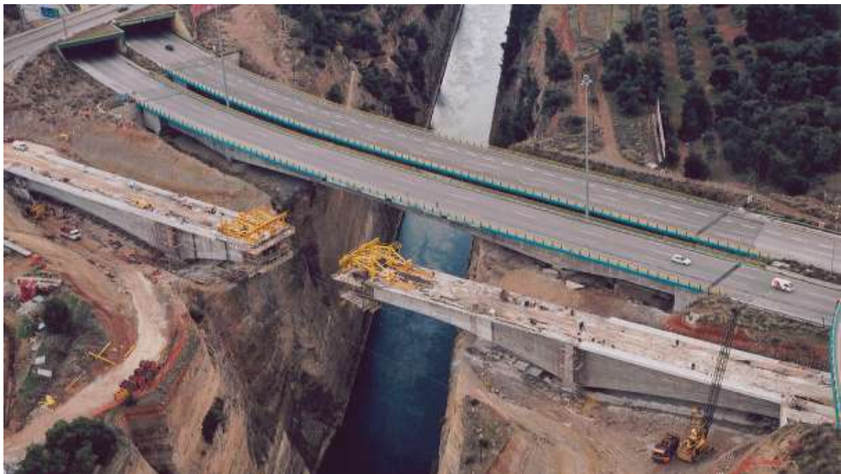
Construction of Bridge over the Corinth Isthmus using the balanced cantilever method

Using conventional framework for the bridge construction, our firm cast two end spans and parts of the middle spans; the remaining part of the central span was constructed via the balanced cantilever method.