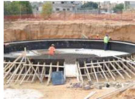
Construction of Water tank Foundation

Due to the political situation in Libya, all works have been suspended.